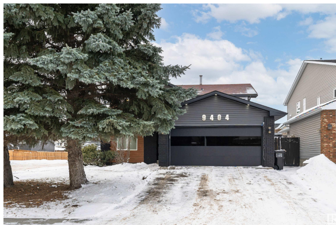
9404 173 St NW, Edmonton, AB

MLS® # E4428659 Price $599,900 Bedrooms 4