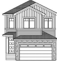
Mirage II - Craftsman